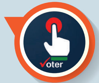
Voter Helpline App

Register online or verify your details at voters.eci.gov.in